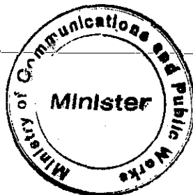
AMOS BANGABITI Minister for Transport, Public Works, Civil Aviation, Ports & Marine and Urban Water Supply.