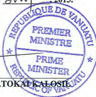
Honourable MOANA CARCASSES KATOKAI KALOSIL Prime Minister

Made at Port Vila this 09 day of July , 2013.